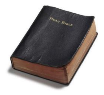
The Bible is the Word of God